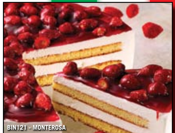
BIN121 - MONTEROSA