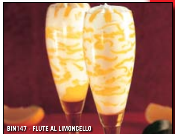
BIN147 - FLUTE AL LIMONCELLO