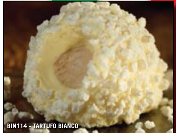
BIN114 - TARTUFO BIANCO