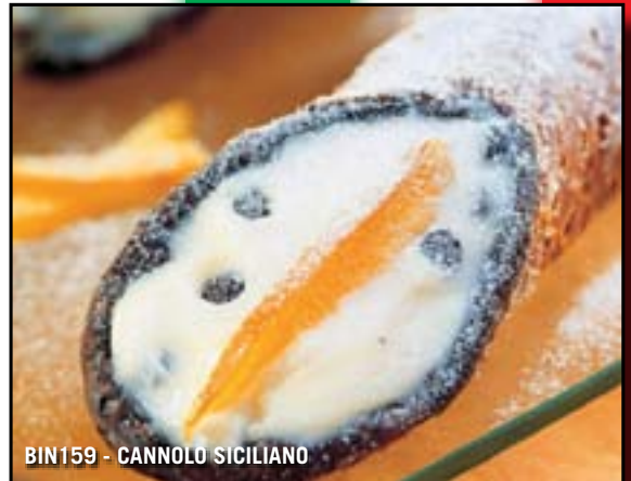
BIN159 - CANNOLO SICILIANO