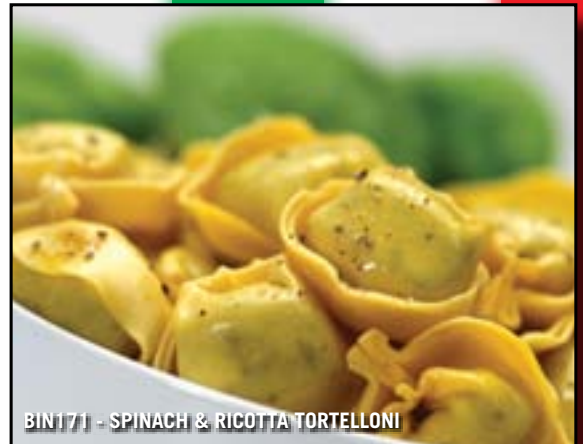
BIN171 - SPINACH & RICOTTA TORTELLONI