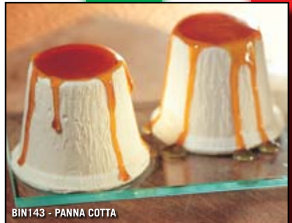
BIN143 - PANNA COTTA