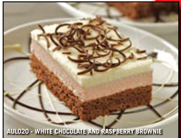
AUL020 - WHITE CHOCOLATE AND RASPBERRY BROWNIE