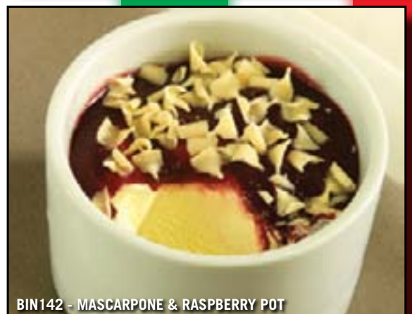
BIN142 - MASCARPONE & RASPBERRY POT