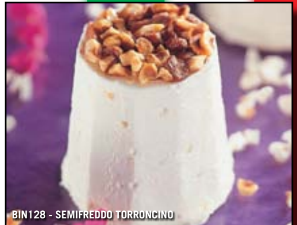
BIN128 - SEMIFREDDO TORRONCINO