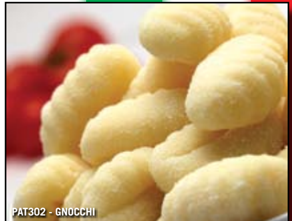
PAT302 - GNOCCHI