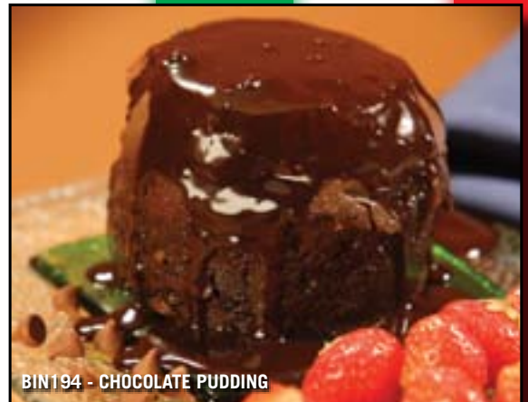
BIN194 - CHOCOLATE PUDDING