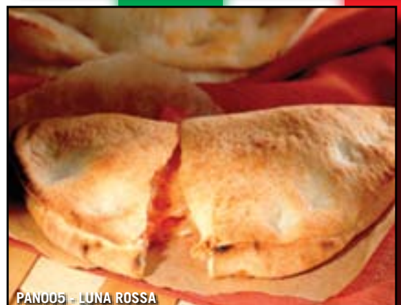
PAN005 - LUNA ROSSA