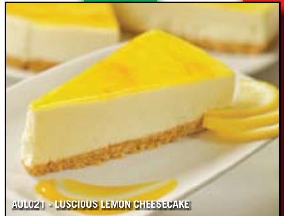
AUL021 - LUSCIOUS LEMON CHEESECAKE