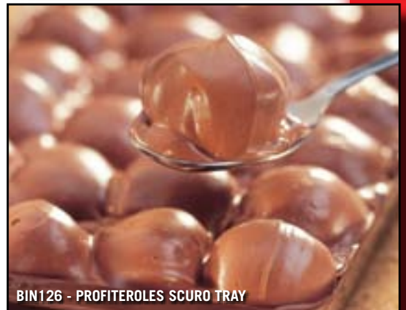
BIN126 - PROFITEROLES SCURO TRAY