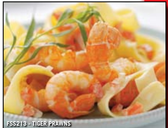
FSS213 - TIGER PRAWNS