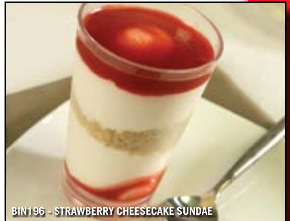
BIN196 - STRAWBERRY CHEESECAKE SUNDAE