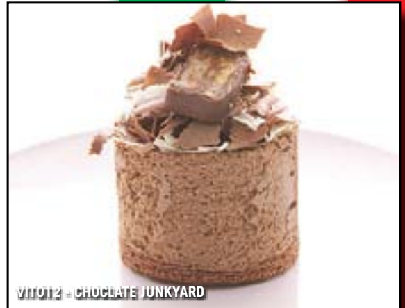
VIT012 - CHOCOLATE JUNKYARD