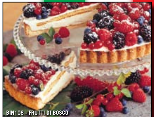
BIN108 - FRUTTI DI BOSCO