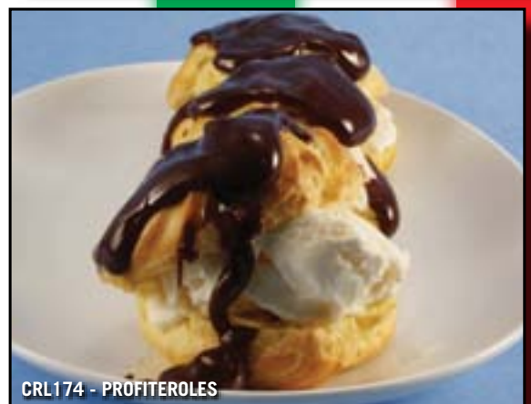
CRL174 - PROFITEROLES