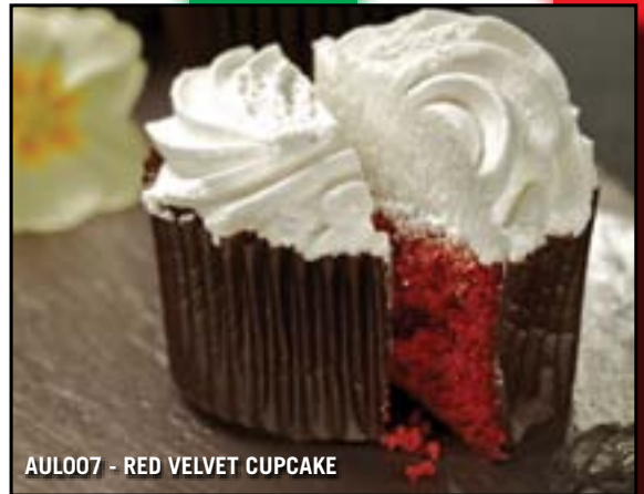
AUL007 - RED VELVET CUPCAKE