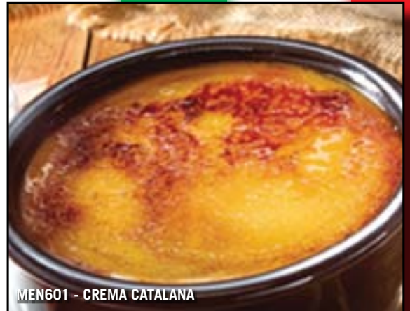
MEN601 - CREMA CATALANA