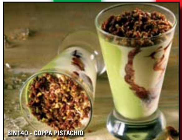
BIN140 - COPPA PISTACHIO