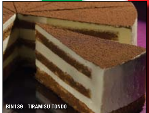
BIN139 - TIRAMISU TONDO