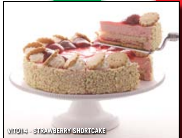
VIT014 - STRAWBERRY SHORTCAKE