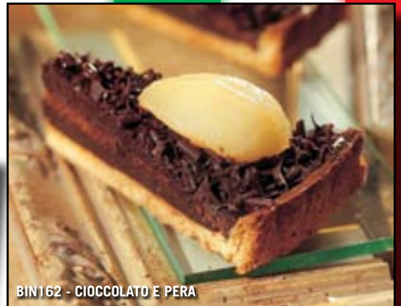
BIN162 - CIOCCOLATO E PERA